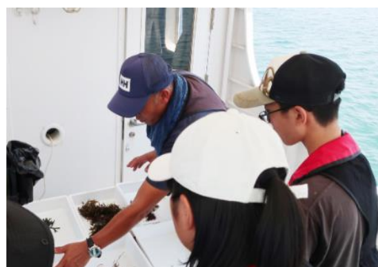
Commentary of the collected creatures