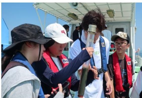
Collection of seabed sediments