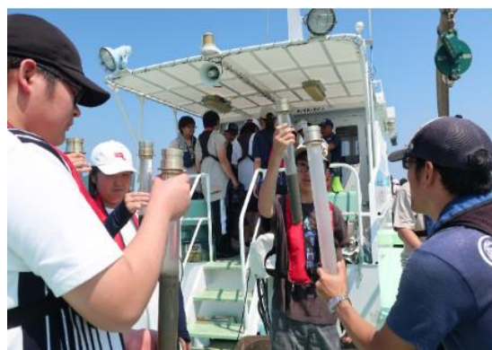
Explanation of seabed sediments