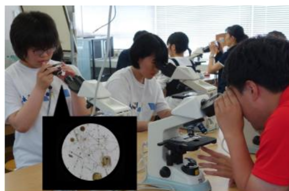
Microscopic observation of plankton