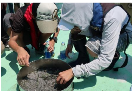
Observation of organisms living in and on the seabed