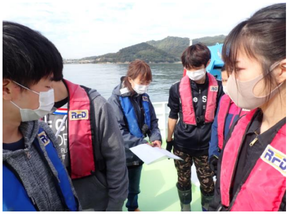
Divided into 3 groups from the recorded value to decide each water sampling layers.