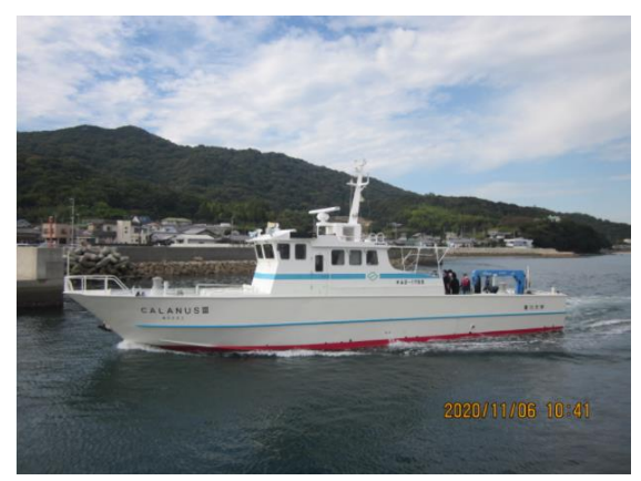
Departure for the practical training on the research vessel Calanus III.

This is the first time, two Universities conducted the practical training for students of Tokushima Bunri University by using facilities of Aji Marine Station.