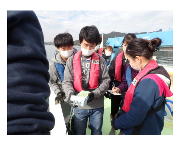
Observation of CTD value.