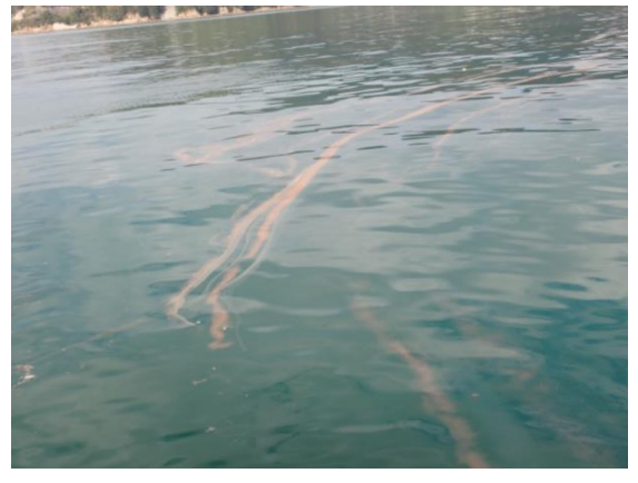
Observing blooms of Noctiluca. (luminous insects)