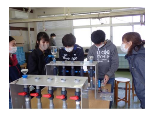
Each group carefully filtering.