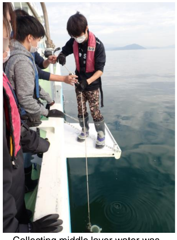
Collecting middle layer water was used the Van Dorn Water Sampler.