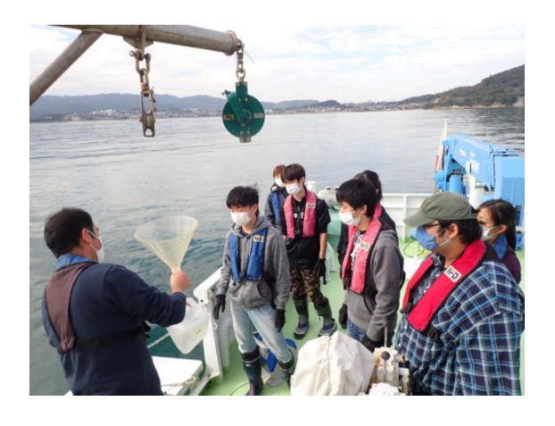
Explanation of water sampling.