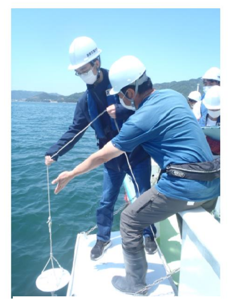
Measurement of seawater transparency.

It is the 2'nd time following last year that the practical training for students of Tokushima Bunri University by using "Calanus III" and facilities of Aji Marine Station.