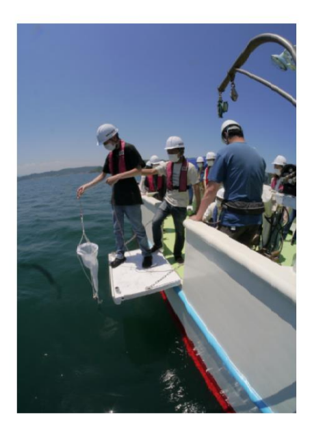
Water sampling by Plankton Net.