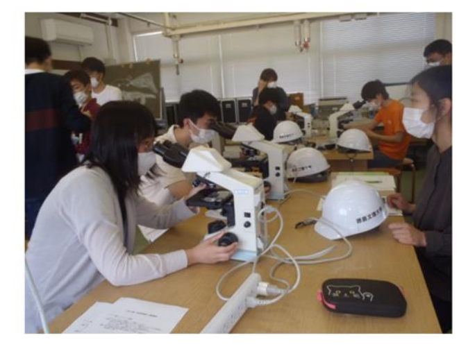
Observations with microscope.