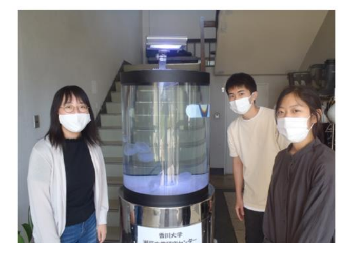
Moon jellyfishes in display aquarium.