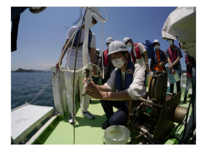
From Plankton Net to Storage Bottles.