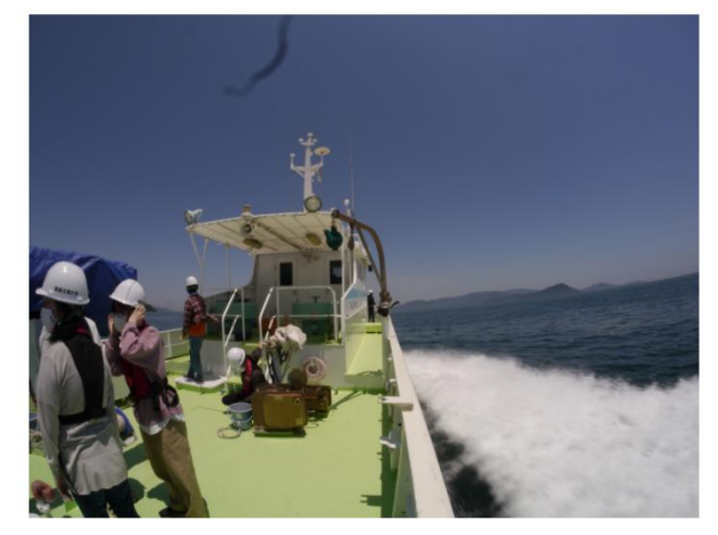
Cruising in the Seto Inland Sea on the "Calanus III".