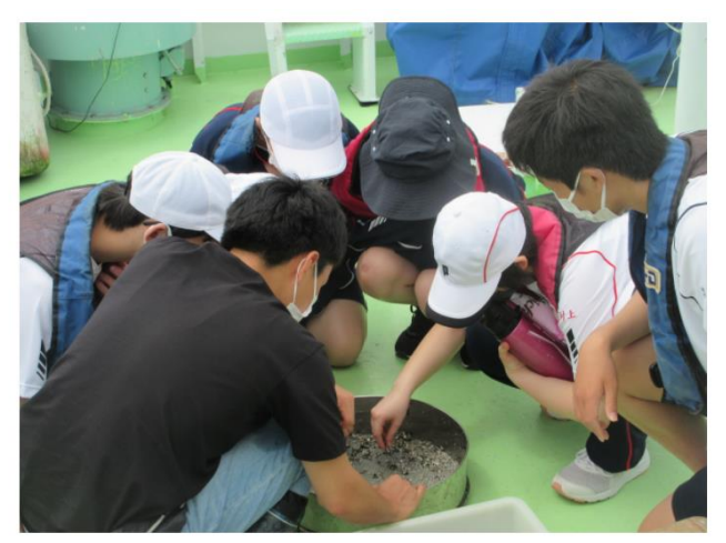
Observation of seabed mud