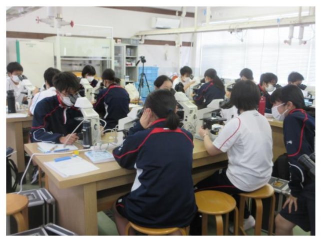
Observation of planktons with microscope