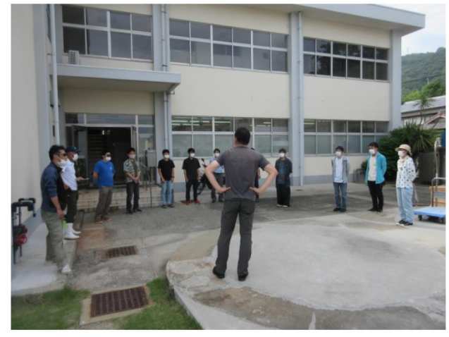
Staff meeting at outdoor, to avoid corona infection

The students asked a lot of questions, etc., they learned very eagerly.