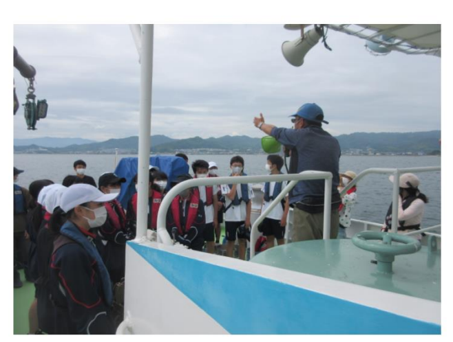
Explanation for observation, on board the Calanus III