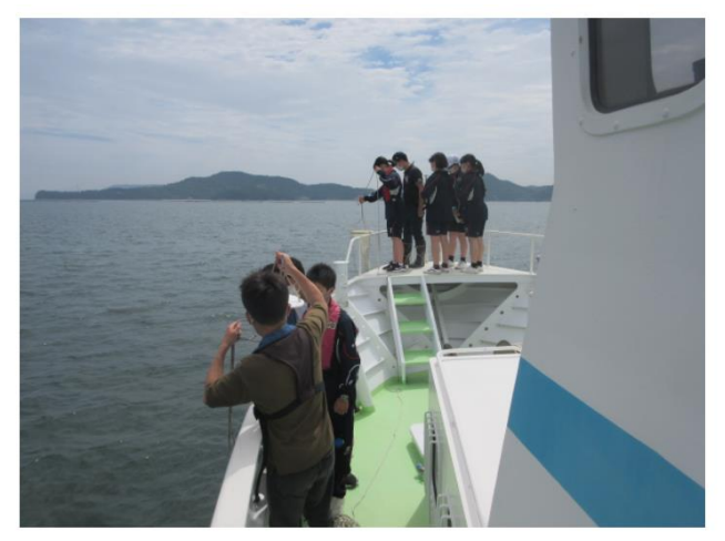
Collection of samples by plankton-net